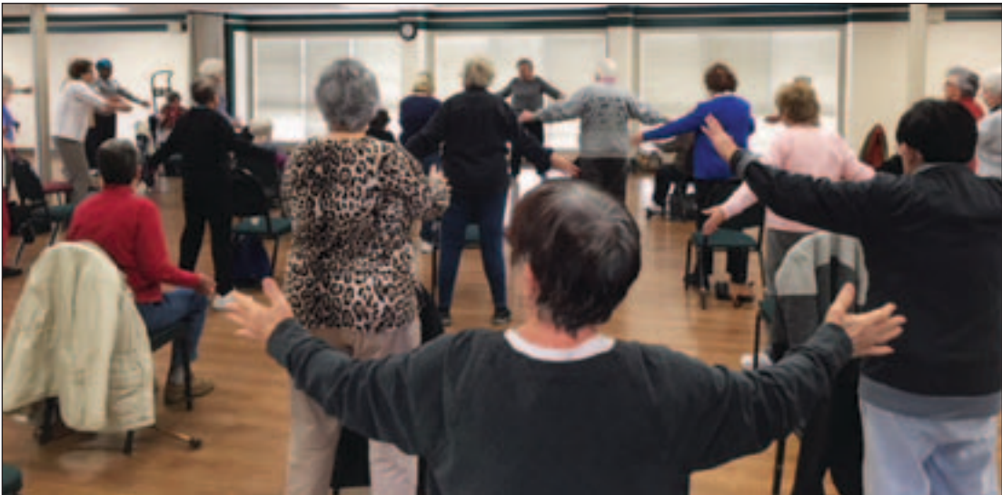
SiA members brought the craziness of the holiday season back into balance with some Tai Chi.

There is something to do Monday through Friday every day of the week!